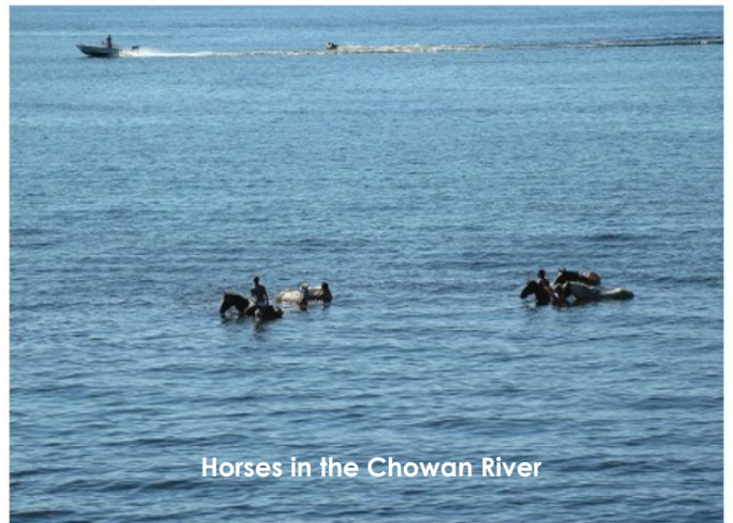
Horses in the Chowan River